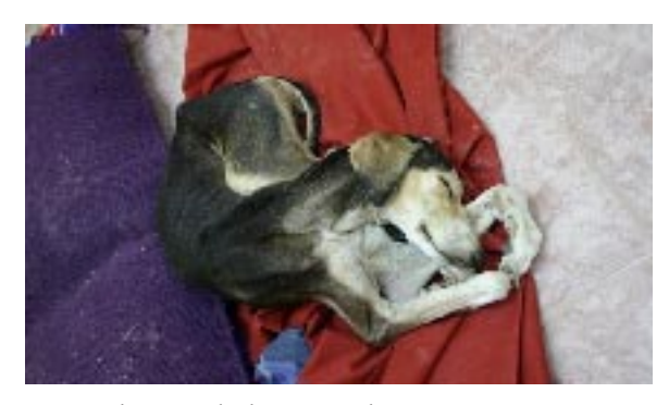
An exhausted sleep on the way to recovery